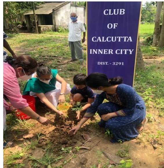
Planting of neem trees at RCC Ranjapur

Rotarians of Rotary Club of Calcutta Inner City planted 5 neem trees at the compound of the school, so that proper care can be taken by RCC Ranjapur.